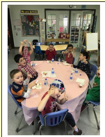
The 4s say, "Valentine parfaits are great!"

The Health Fair schedule will be: 9:00 - 3s T/Th and MWF classes 10:00 - 4s T/Th class 11:00 - 4s M-F and MWF class