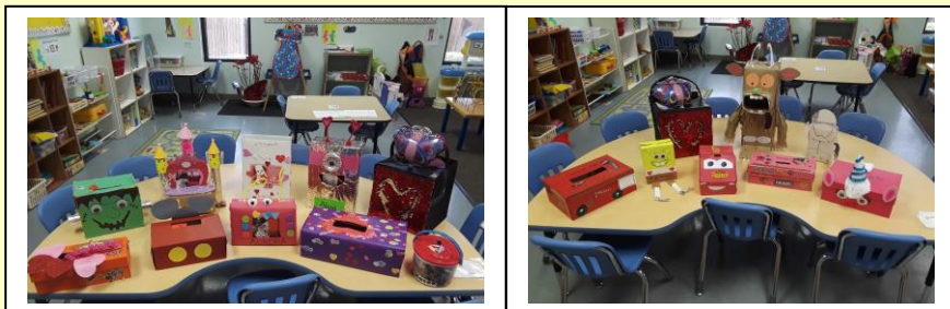
3's Valentine Boxes